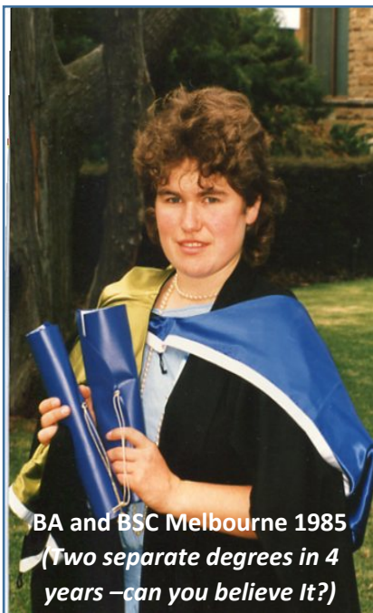
BA and BSC Melbourne 1985 (Two separate degrees in 4 years – can you believe It?)