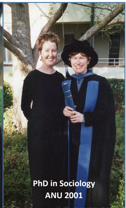
PhD in Sociology ANU 2001