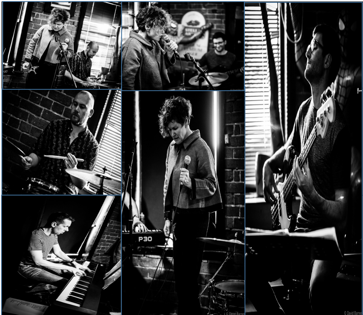
Sunday afternoon jazz and grooves, The Fox Hotel Collingwood - 4:00-7:00pm (2015)