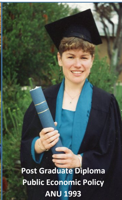
Post Graduate Diploma Public Economic Policy ANU 1993